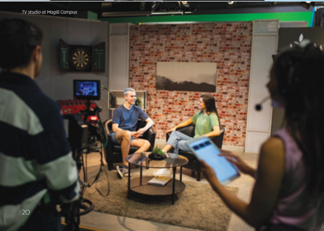
TV studio at Magill Campus