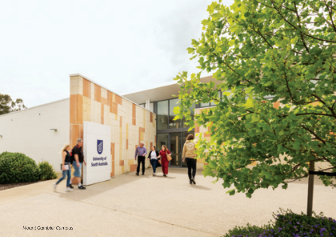
Mount Gambier Campus