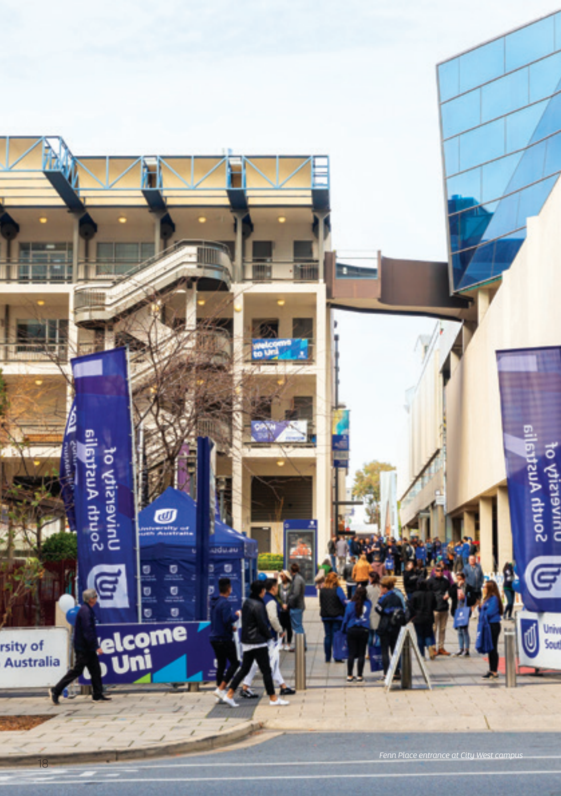
Fenn Place entrance at City West campus