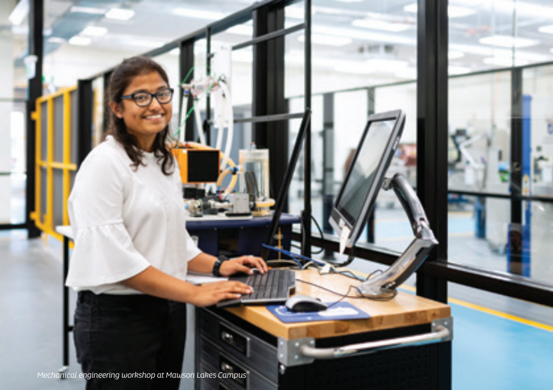
Mechanical engineering workshop at Mawson Lakes Campus